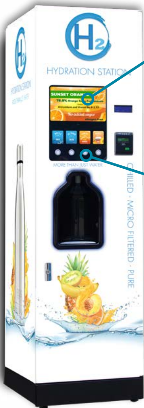
Standard juice graphics