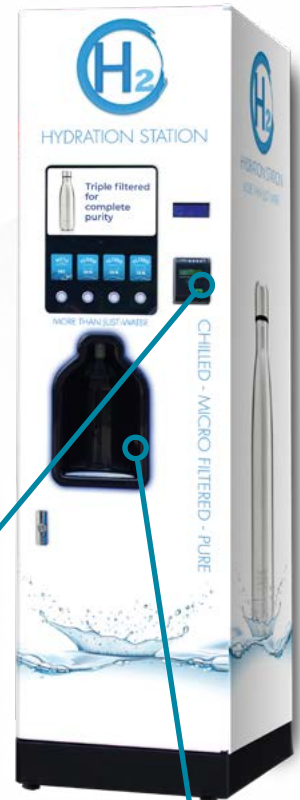
Standard water only graphics

Supports Free-vend and most cashless payment systems.