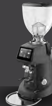
F83 E SENSE