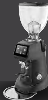
F64 EVO PRO SENSE