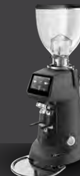
F83 E PRO SENSE