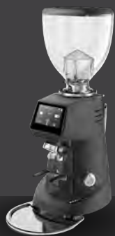
F64 EVO SENSE